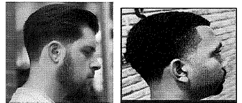
Examples of taper/graduation portion